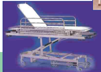
Emergency & Recovery Trolley